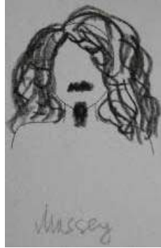
Ormond Abbey - writer.