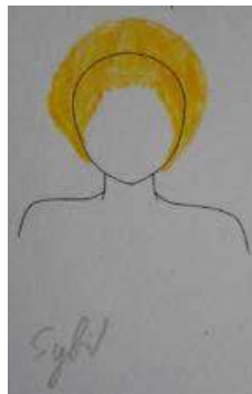
Beaufort Lefebvre - Sybil's husband.